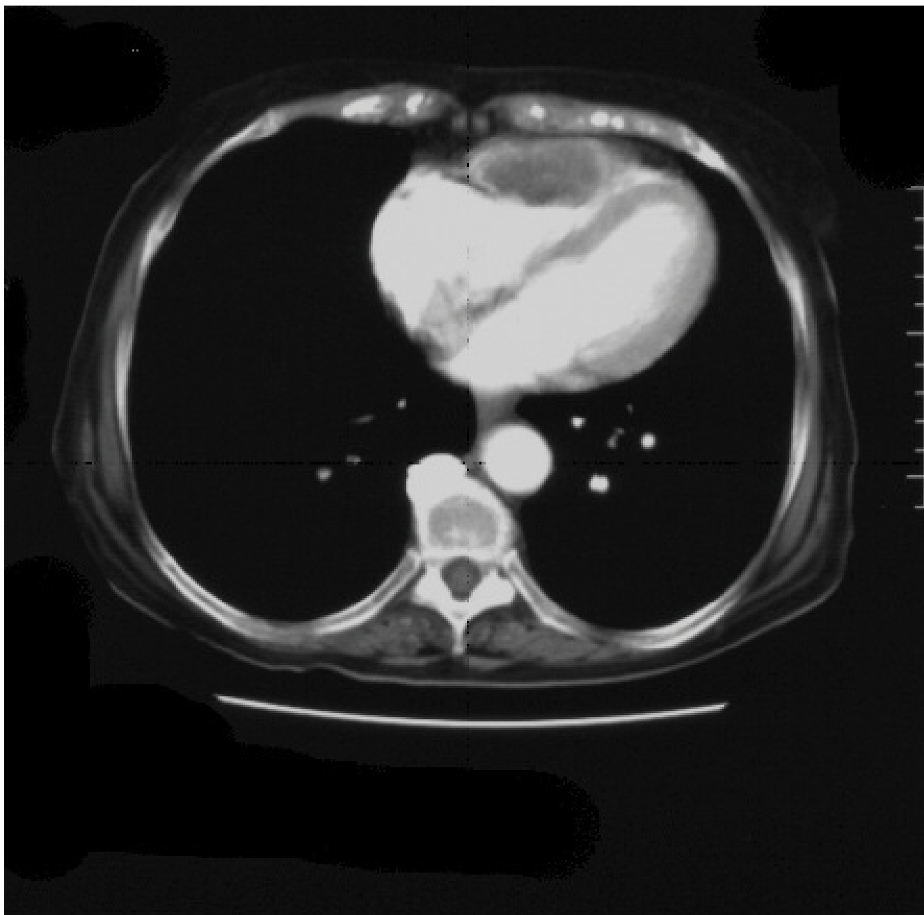
Figure 1 Contrast CT thorax demonstrating filling defect and lesion in right anterior ventricular wall.

radiotherapy. Trans-oesophageal echocardiography showed that the lesion extended into the body of the right ventricle and significantly reduced ventricular volume (Figure 2). The edges of the lesion were fimbriated and mobile, consistent with a metastatic deposit. Although the platelet count and clotting improved with Vitamin K and